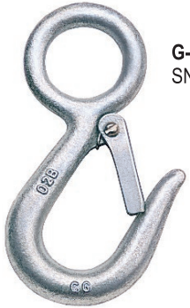
G-3315 SNAP HOOK